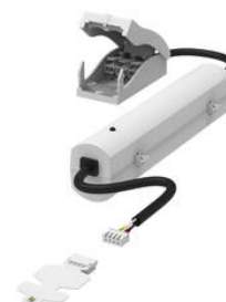
Push-wire terminal block included